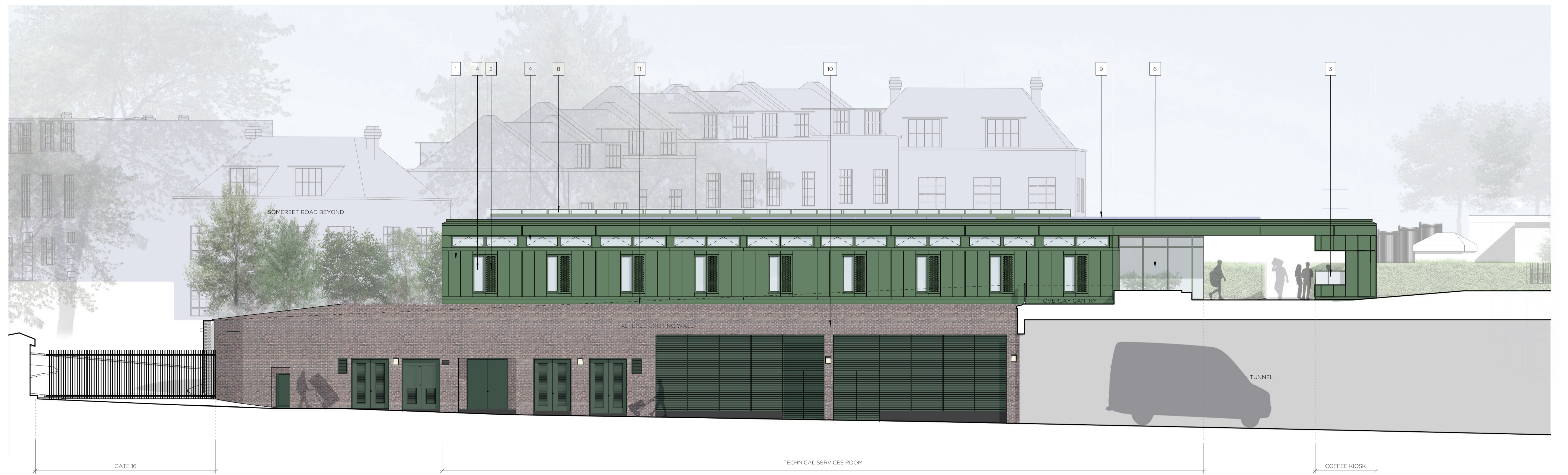
2 Proposed GA Elevation - East